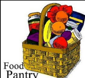
Food Pantry Ministry

The Food Pantry is a joint project of Soldotna United Methodist Church and Christ Lutheran Church. Additional support comes from generous individuals, organizations, local businesses, as well as help from the Kenai Peninsula Food Bank.